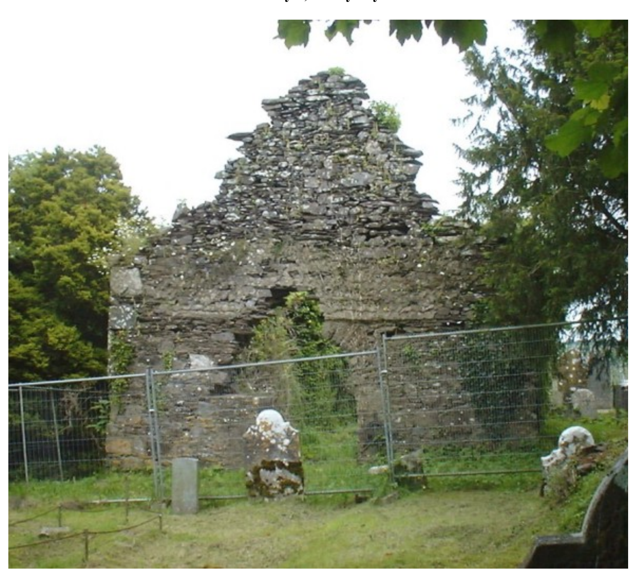
St Mary's, Garrycloyne