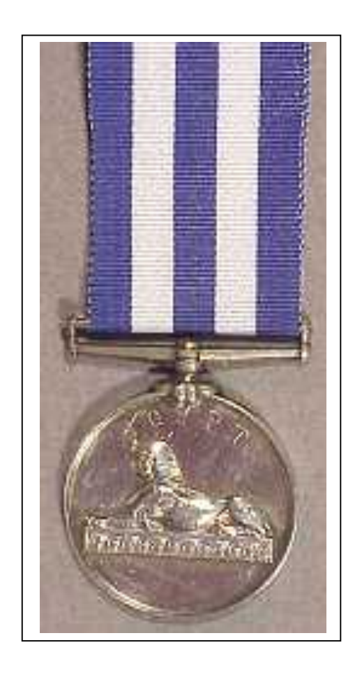
Egyptian Campaign Medal 1882 and Khedive Star