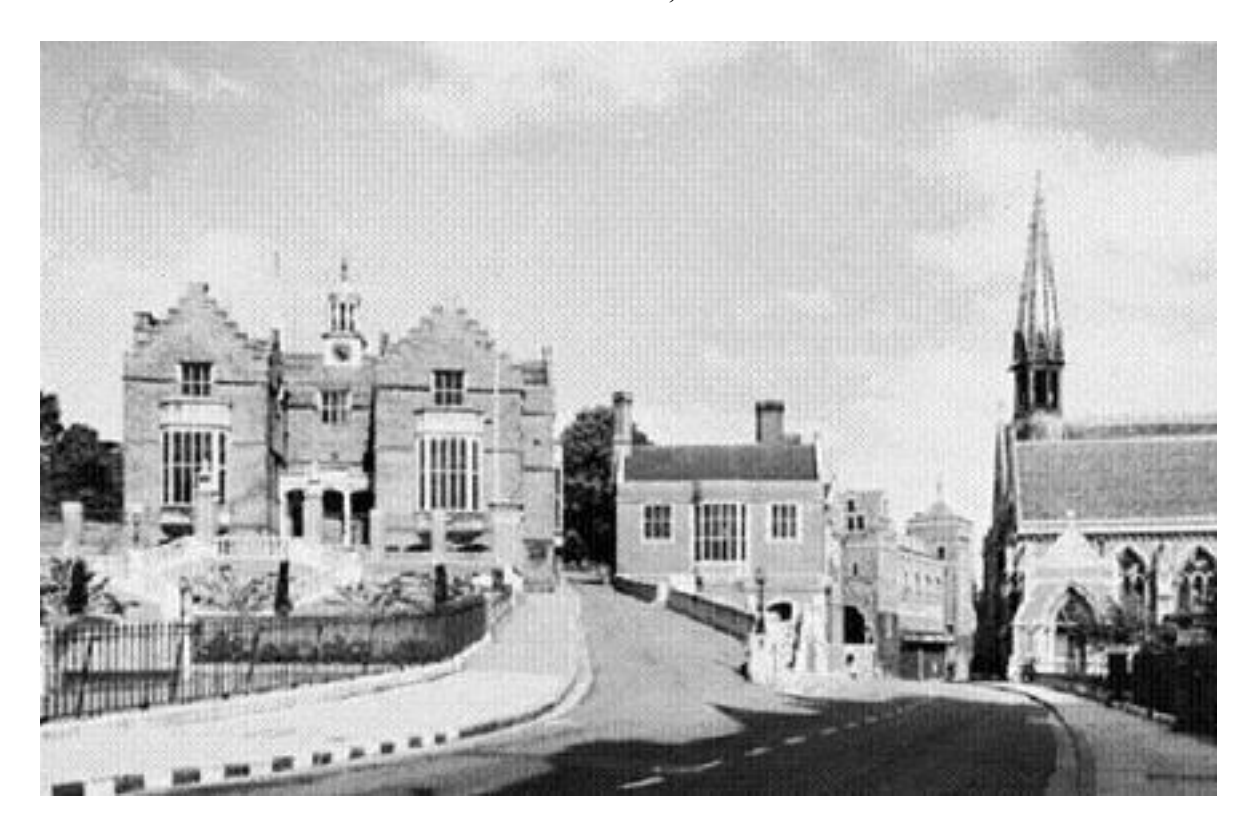
Exeter College, Oxford