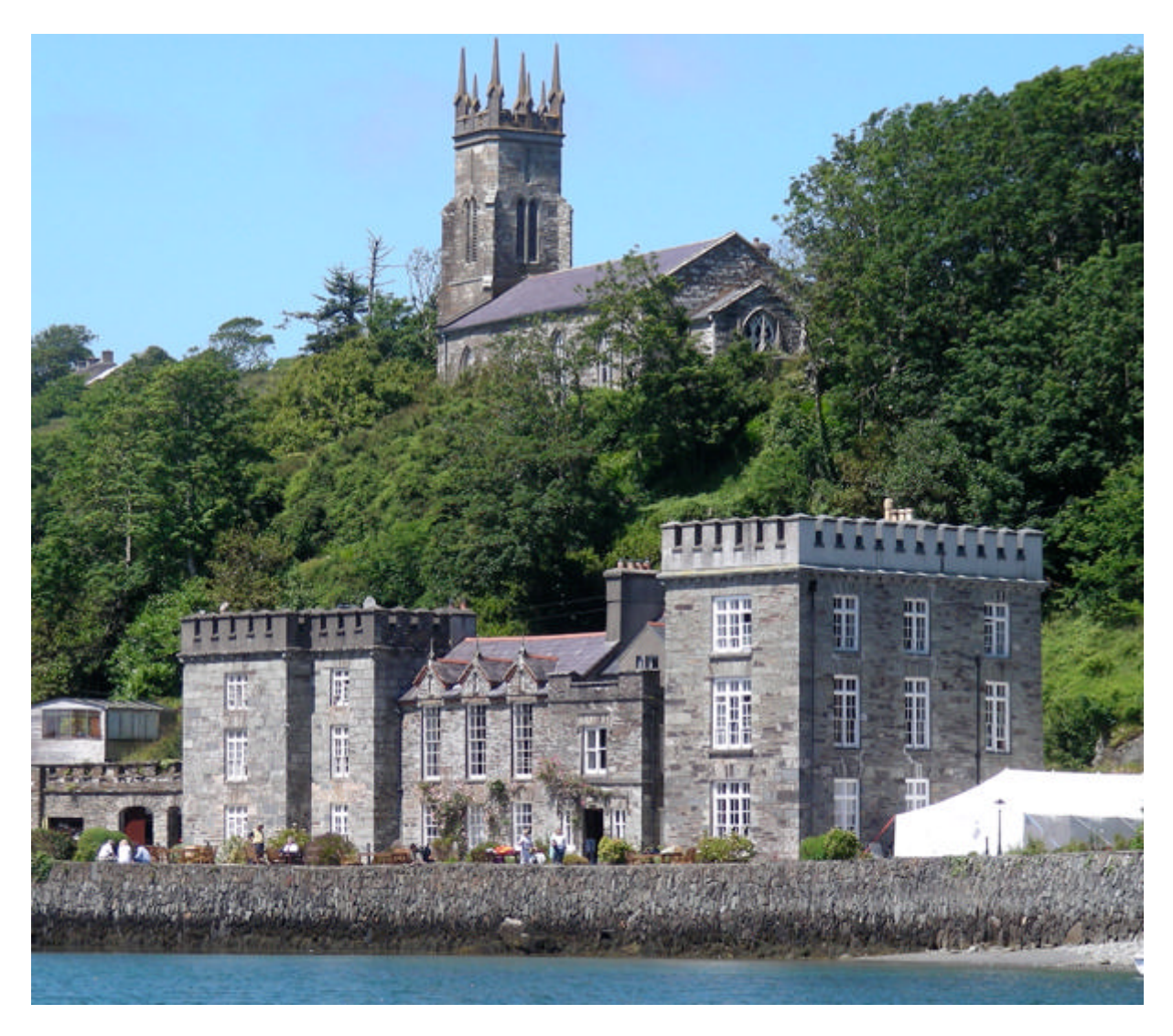
The Main Street

The Castle and St Barrahane's Church 2013