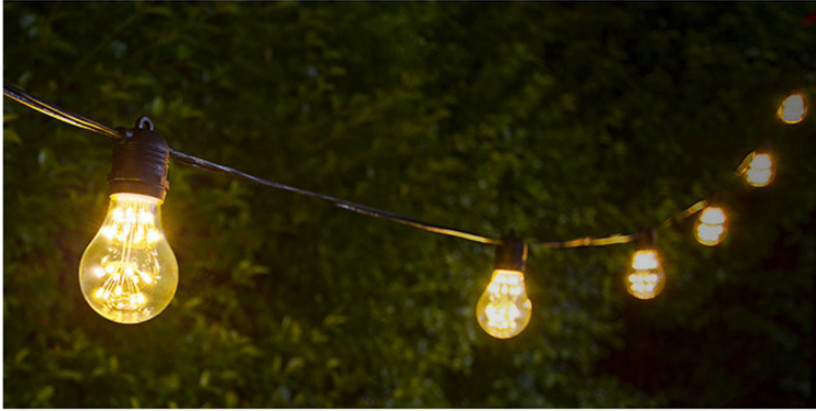
Light sources appear dimmer in the distance