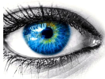
Apparent brightness = light concentration