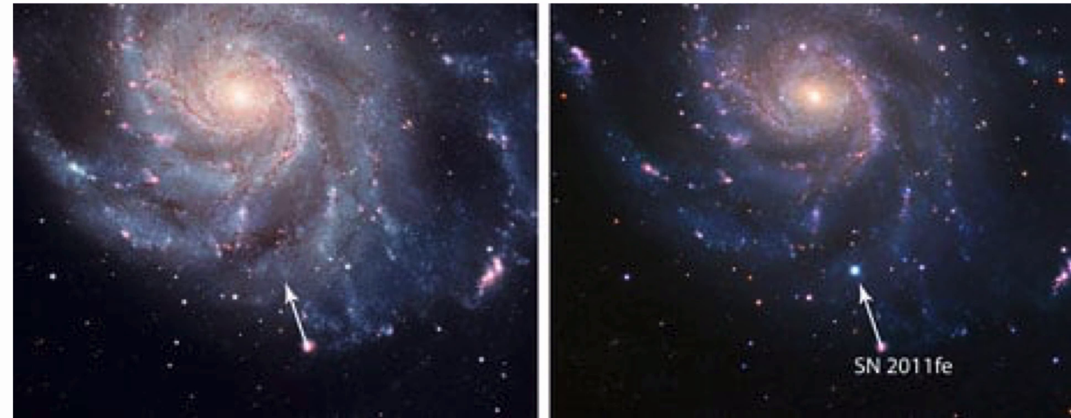
Supernova in M101 Galaxy (Pinwheel)

To go to much greater distances, use Type Ia supernovae (exploding white dwarfs)