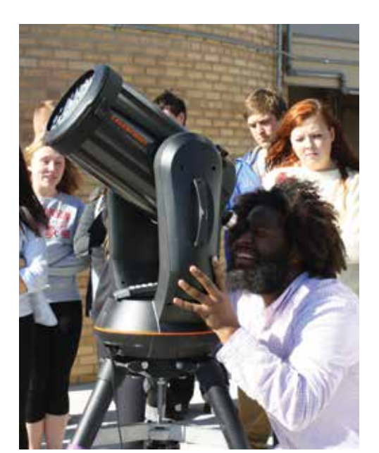
Students view sunspots using a solar filter from the newly renovated rooftop on Sterling Hall.